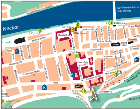
© ZENTRALBEREICH – Print + Medien – INF · 10/2009